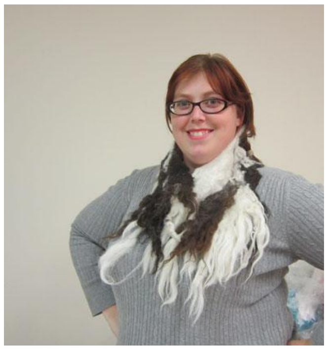
Black and White very matted neck fiber 8 year old llama, Nadine felted a beautiful neck piece