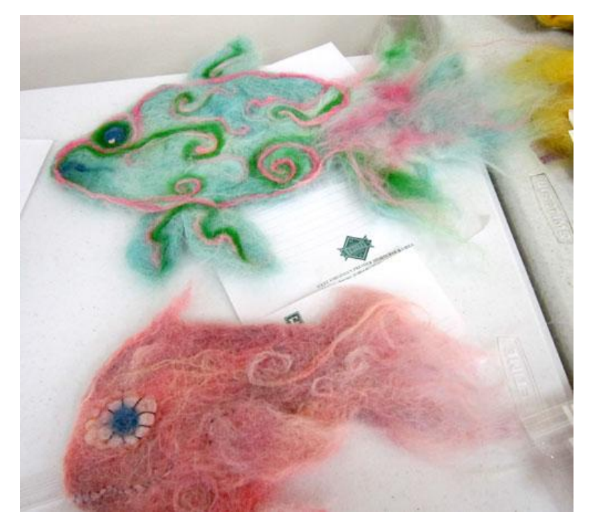
Needle felted fish, shape with and stitching. Made from 13 year old, felted neck fiber, very matted. Double coat, lots of guard hair.